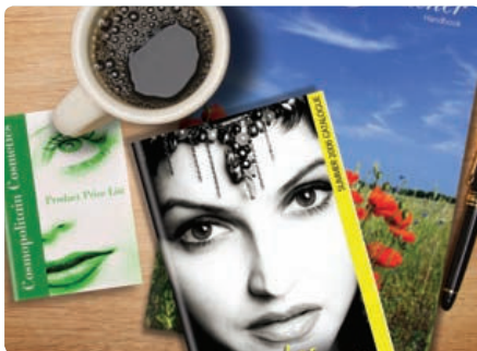
This page is printed on 115gm Triple Coated Silk Art Paper.

*Up to 10,000 for Wire Stitched and Looped Booklets and up to 2,500 for Perfect Bound Booklets. For larger quantities turnaround agreed at time of order. All prices are + Carriage and VAT at applicable rates. Terms are payment with order.