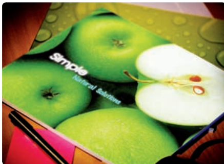
This page is printed on 115gm Triple Coated Silk Art Paper.

*Up to 10,000 for Wire Stitched and Looped Booklets and up to 2,500 for Perfect Bound Booklets. For larger quantities turnaround agreed at time of order. All prices are + Carriage and VAT at applicable rates. Terms are payment with order.